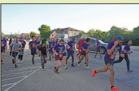
Families and participants enjoyed a day of fun and excitement!