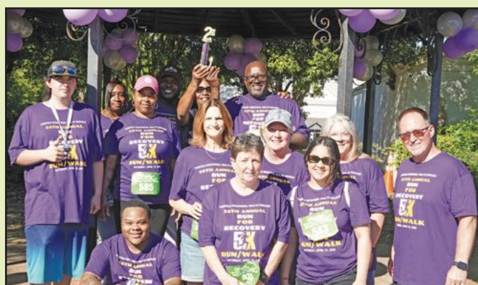
2nd Place Team Isola Laminate Group