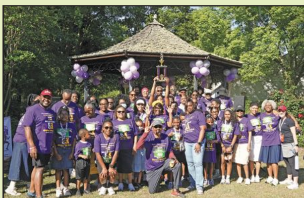
1st Place Team Bible Light Holiness Church of Jesus Christ