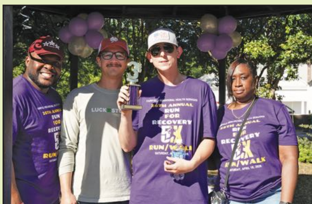
3rd Place Team Luck Stone