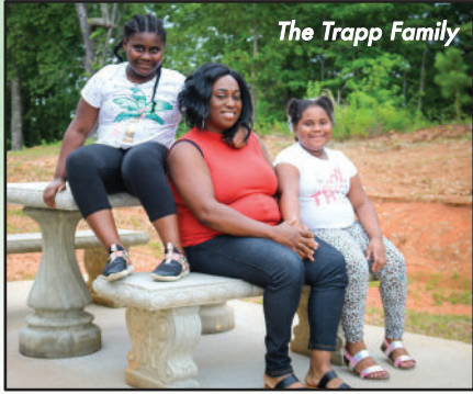
The Trapp Family