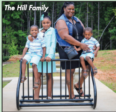
The Hill Family