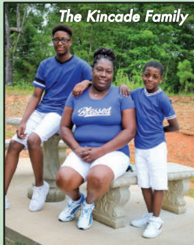
The Kincade Family