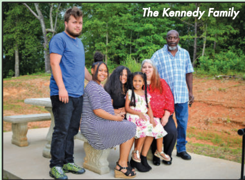
The Kennedy Family